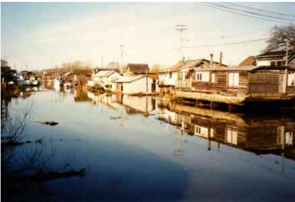
Finn Slough seen from the side of the Lulu Island. The house in front has been built on a ferry and transported here from another place of Slough. - Photo: Ron Ericson 1999.