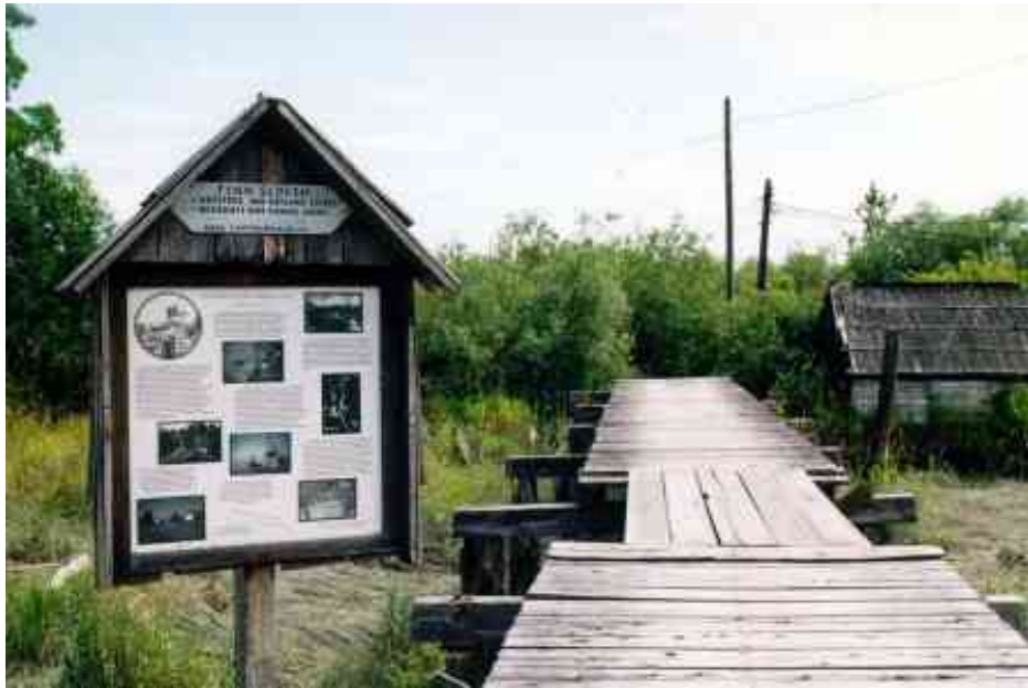
The only "draw bridge" in Richmond. When a new bridge was needed between Gilmour Island and the North bank of Finn Slough, the Anglo British Fishing Company donated all the required lumber. The fishermen gave their skills and labour voluntarily for the common cause. When a fisherman wants to take his boat through the "draw bridge" he simply draws four planks out, takes his boat through, and replaces the planks. The bridge was so well constructed in the 1940's that it is still in use today.